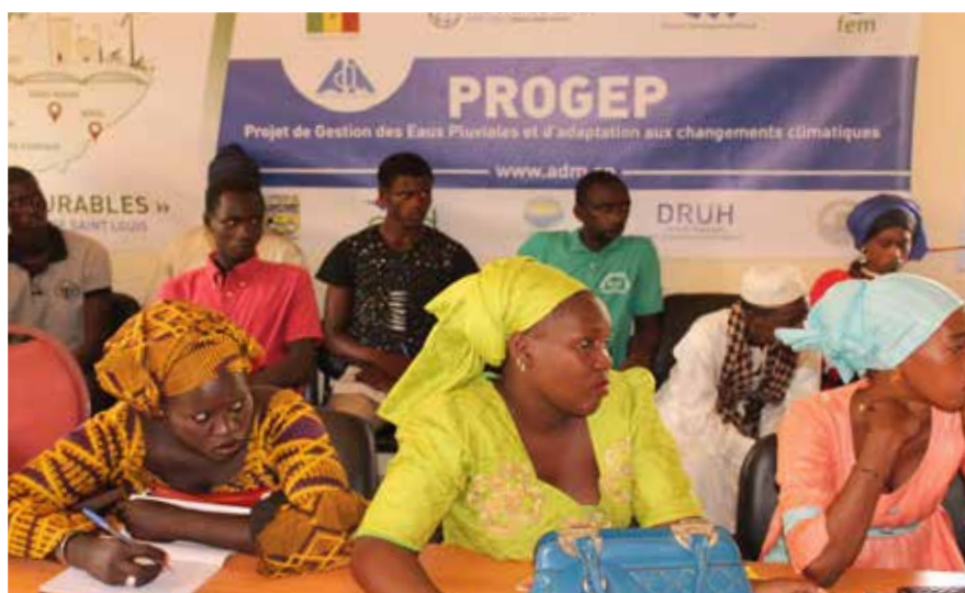
Agents of the State's technical services and the residents of Saint-Louis are carefully following a training course on intercommunality and environmental governance.

intercommunality will not only apply to solving waste management. This approach lays the foundations for a concerted approach to managing other issues such as: coastal erosion, mobility, improving access to rural communities, access to drinking water and electricity, etc. It is necessary to develop concrete projects on its axes of intervention to support this emerging intercommunal cooperation.