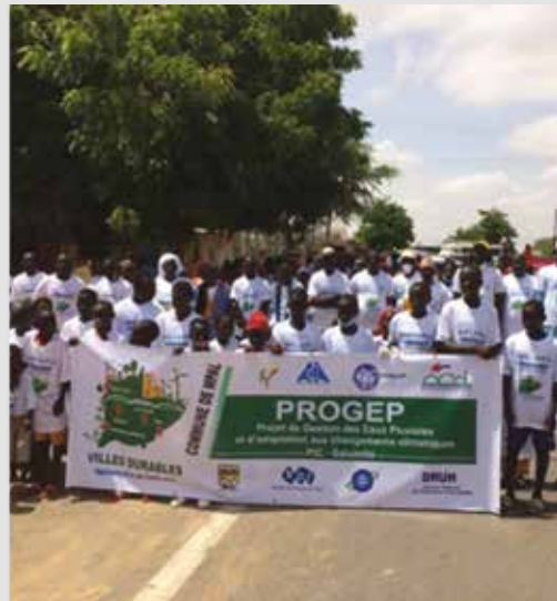
The means and residents of the municipality of Mpal mobilized for an action "Sét Sétal" ('Clean and make clean' in Wolof) within the framework of PROGEP.