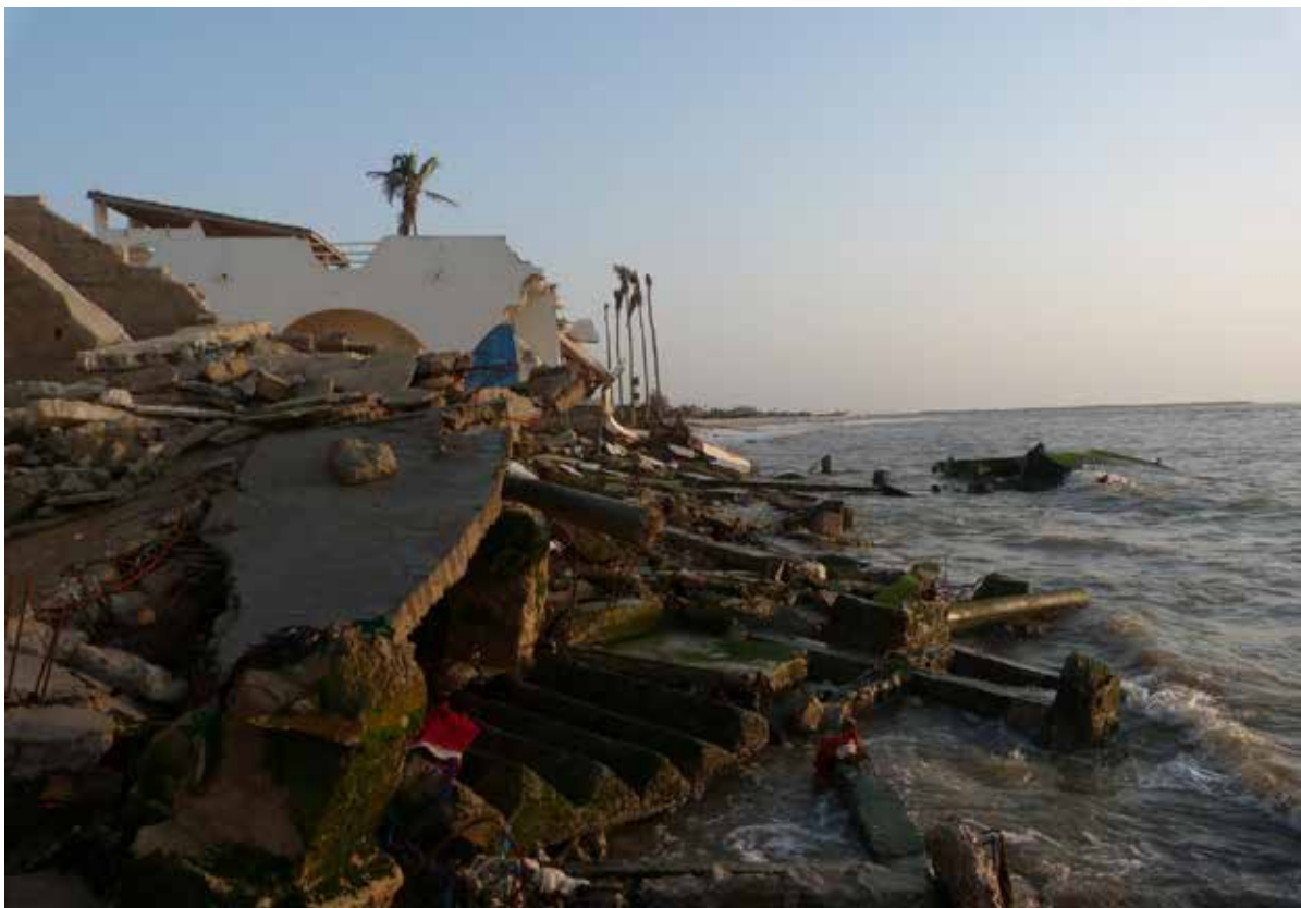
Coastal erosion, one of the most significant threats to neighborhoods located on the “Langue de Barbarie” (Saint-Louis).

The challenges to be addressed are therefore multiple and complex and go beyond the boundaries of the city of Saint-Louis. They should be sought through a multidisciplinary, concerted and inclusive approach with all regional actors. Taking into account the principles governing sustainable development, responses should take into account the needs of current generations without compromising those of future generations.