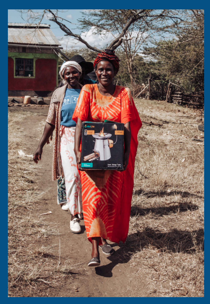
© Miguel Oliveira - EEP Africa